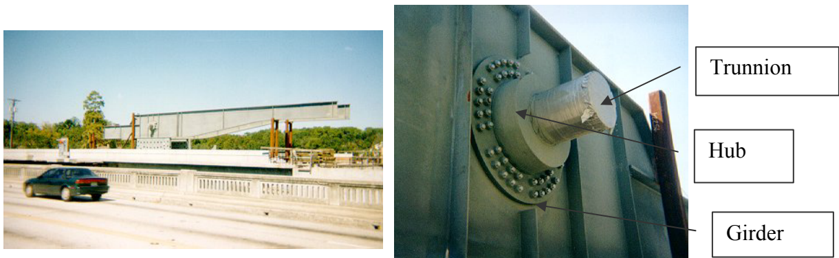
Figure 1 Trunnion-Hub-Girder (THG) assembly.

To make the fulcrum (Figure 1) of a bascule bridge, a long hollow steel shaft called the trunnion is shrink fit into a steel hub. The resulting steel trunnion-hub assembly is then shrink fit into the girder of the bridge.